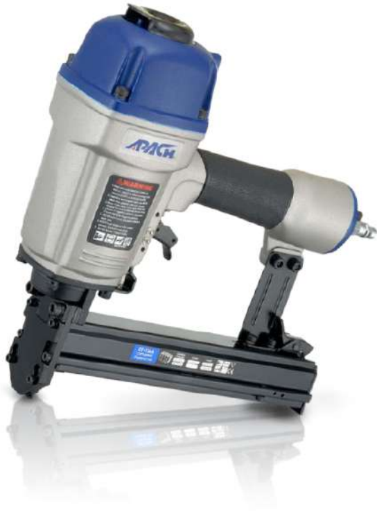
CF-15AP Paslode Type