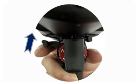
Use Your Forefinger to Push back