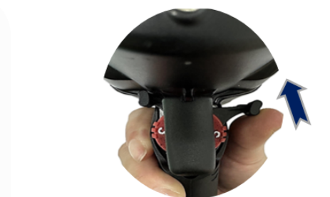
Use Your Thumb to Push up