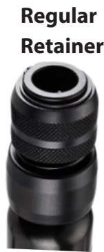
Regular Retainer Needs a strong push down