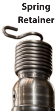
Spring Retainer Traditional One Change slowly